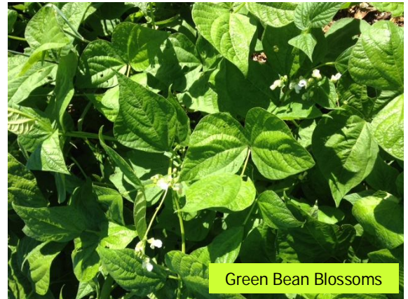
Green Bean Blossoms

And this is my [Paul's] prayer [for his brothers and sisters in Philippi]....that your love may overflow more and more with knowledge and full insight to help you to determine what is best, so that in the day of Christ you may be pure and righteous, having produced the harvest of righteousness that comes through Jesus Christ for the glory and praise of God. (Philippians 1: 9-11)